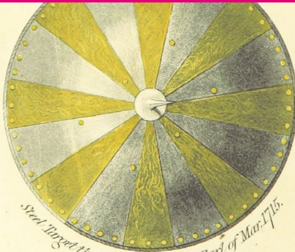
Steel Target that belonged to the Earl of Mar. 1715.